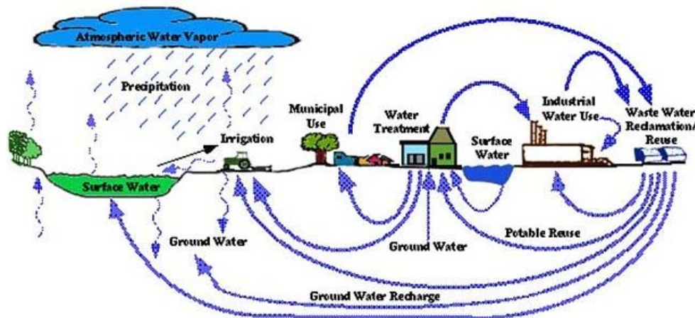
Figure 2. The Hydrologic Cycle (T. Asano and A Levine 1995)

All water is ultimately recycled as is illustrated by the hydrologic cycle. The hydrologic cycle refers to the continuous transport of water in the environment, involving evaporation from the surfaces of biota, land and water bodies to form clouds, its movement through the climate system and its subsequent precipitation as rain or snow. Man has learned to intervene in this cycle by developing water storages, and reticulation systems to facilitate the use of water, its subsequent treatment for reuse and/or discharge back into the environment. The components of the hydrological cycle are shown in figure 2.